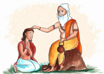
HAPPY GURU PURNIMA