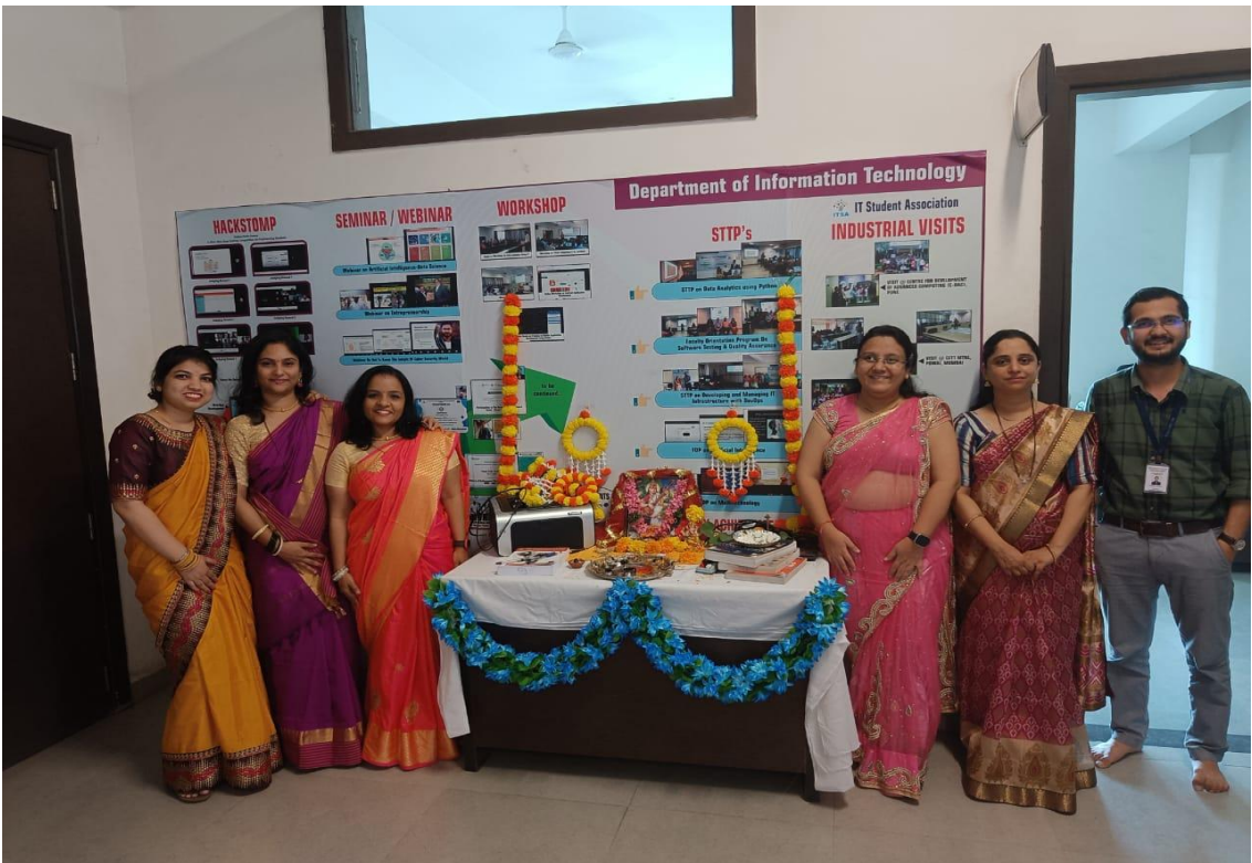
Dussehra pooja on 4th October 2022 – IT Department