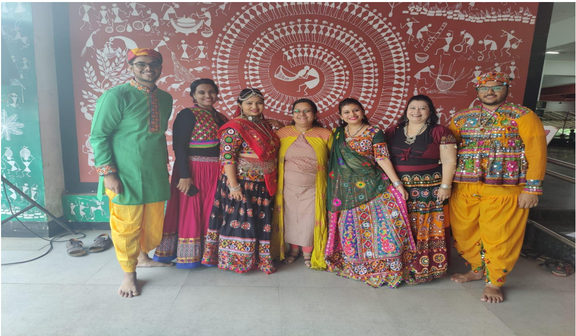
Tahuko – 1 st October 2022